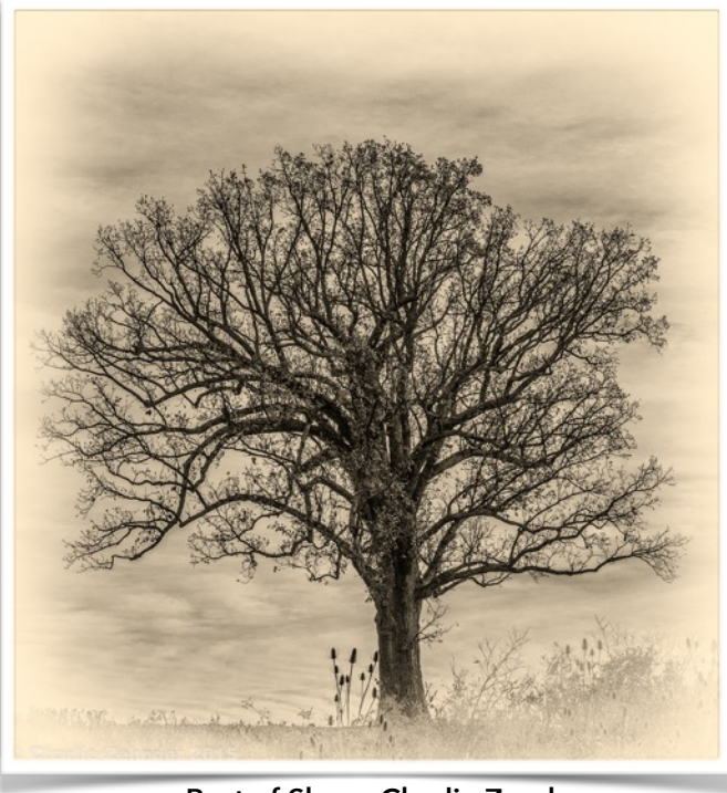
Best of Show: Charlie Zender